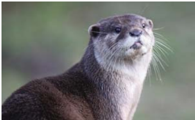
Asian Small Clawed Otter Amblyonyx canescens

"My favorite thing about working with animals is that I know that the space I occupy on the planet isn't wasted, but is used to try to preserve it," she says. "My favorite part of the job is getting to observe and study the behavior of the animals."